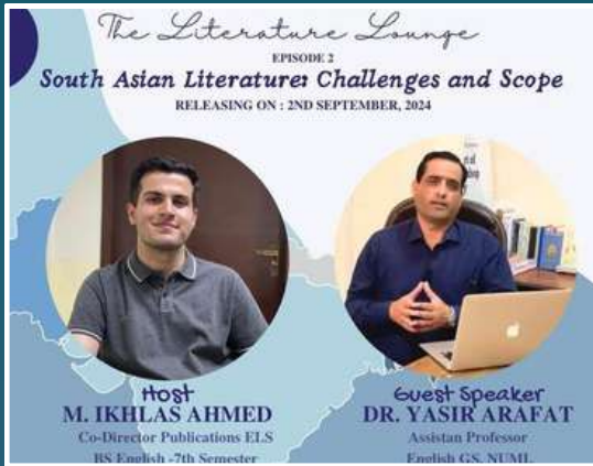
The 2nd Episode of Podcast Series titled "South Asian Literature: Challenges and Scope"