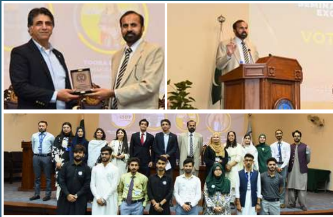
Speakers and Participants of the Seminar on UGRAD Scholarship Program